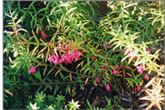
Dwarf Turkestan Burning Bush flowers

This shrub performs well in both full sun and full shade. It is very adaptable to both dry and moist locations, and should do just fine under typical garden conditions. It may require supplemental watering during periods of drought or extended heat. It is not particular as to soil type or pH. It is highly tolerant of urban pollution and will even thrive in inner city environments. This is a selected variety of a species not originally from North America.