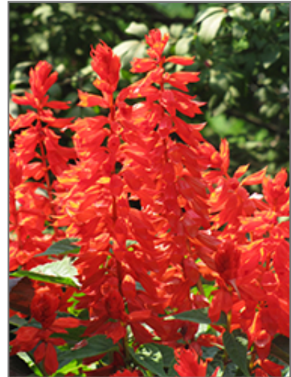
Lighthouse Red Sage flowers