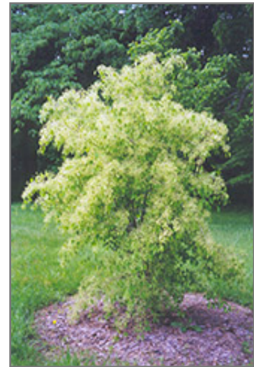
Maack's Spindle Tree in bloom