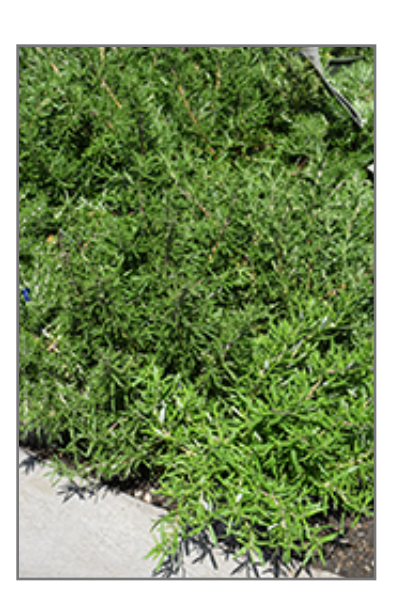
Roman Beauty Rosemary

Aside from its primary use as an edible, Roman Beauty Rosemary is sutiable for the following landscape applications;