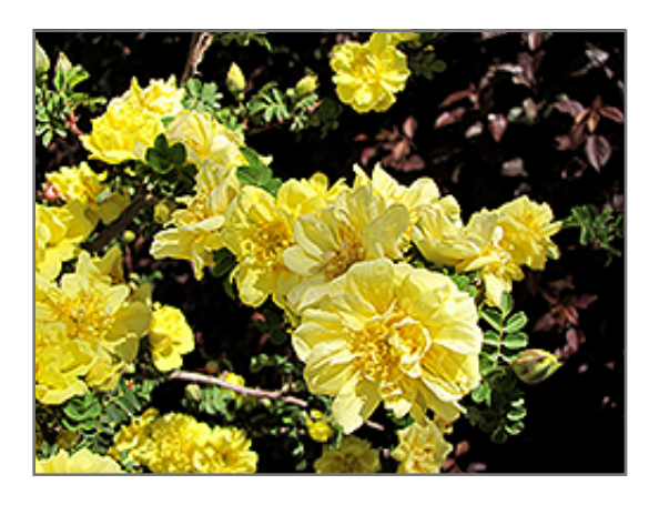
Flore Pleno Rose flowers

This is a high maintenance shrub that will require regular care and upkeep, and is best pruned in late winter once the threat of extreme cold has passed. It is a good choice for attracting bees to your yard. Gardeners should be aware of the following characteristic(s) that may warrant special consideration;