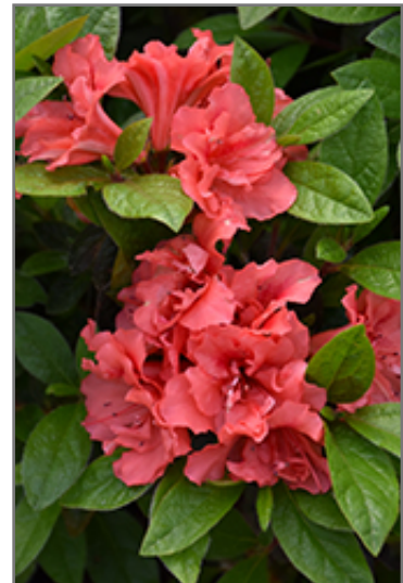
Encore Autumn Monarch Azalea flowers