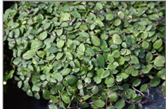
County Park Star Creeper foliage