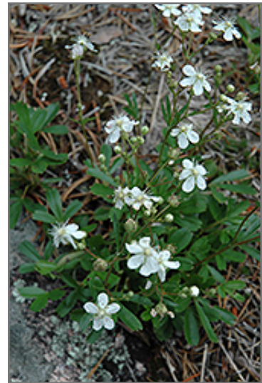
Three Toothed Potentilla flowers