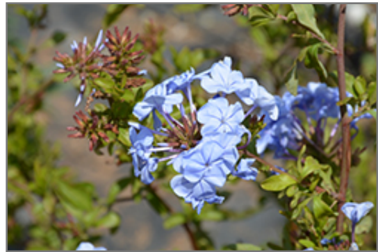
Imperial Blue Plumbago flowers

Imperial Blue Plumbago is recommended for the following landscape applications;