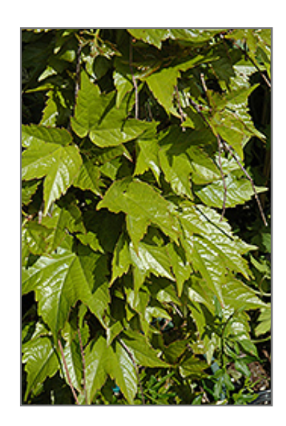
Golden Showers Boston Ivy foliage

Golden Showers Boston Ivy will grow to be about 40 feet tall at maturity, with a spread of 24 inches. As a climbing vine, it tends to be leggy near the base and should be underplanted with low-growing facer plants. It should be planted near a fence, trellis or other landscape structure where it can be trained to grow upwards on it, or allowed to trail off a retaining wall or slope. It grows at a fast rate, and under ideal conditions can be expected to live for approximately 20 years.