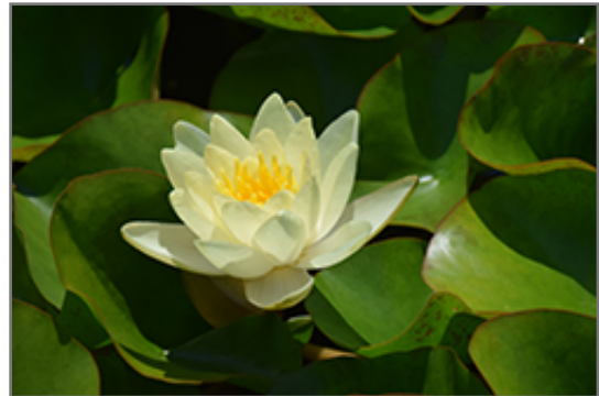
Marliacea Chromatella Hardy Water Lily flowers