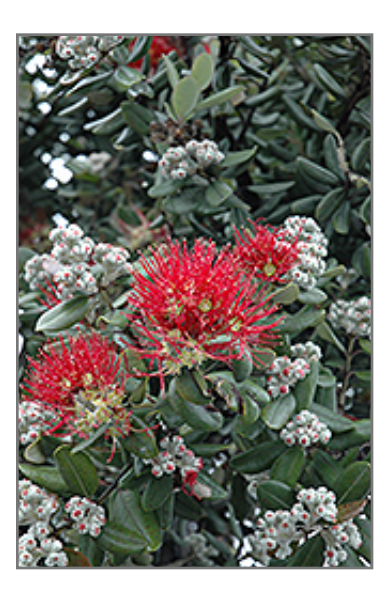
Pohutukawa flowers