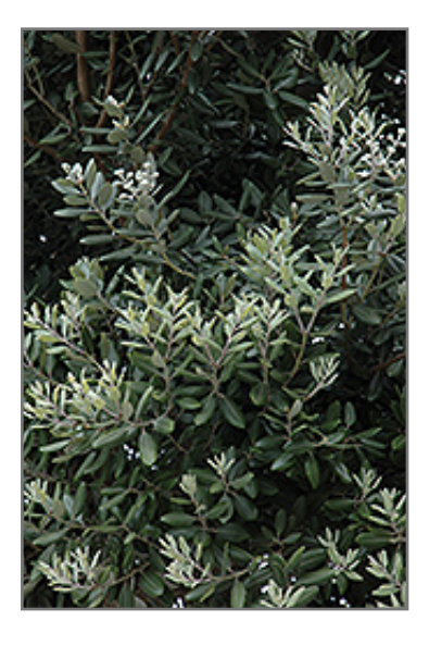
Pohutukawa foliage

This tree should only be grown in full sunlight. It does best in average to evenly moist conditions, but will not tolerate standing water. It may require supplemental watering during periods of drought or extended heat. It is particular about its soil conditions, with a strong preference for rich, acidic soils, and is able to handle environmental salt. It is somewhat tolerant of urban pollution, and will benefit from being planted in a relatively sheltered location. This species is not originally from North America.