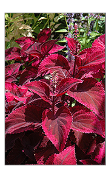
Mariposa Coleus foliage

Mariposa Coleus will grow to be about 24 inches tall at maturity, with a spread of 30 inches. When grown in masses or used as a bedding plant, individual plants should be spaced approximately 24 inches apart. Although it's not a true annual, this fast-growing plant can be expected to behave as an annual in our climate if left outdoors over the winter, usually needing replacement the following year. As such, gardeners should take into consideration that it will perform differently than it would in its native habitat.