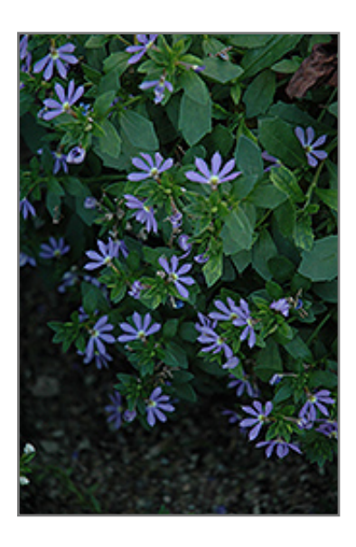
Surdiva Light Blue Fan Flower flowers

Surdiva Light Blue Fan Flower will grow to be about 12 inches tall at maturity, with a spread of 24 inches. When grown in masses or used as a bedding plant, individual plants should be spaced approximately 18 inches apart. Its foliage tends to remain dense right to the ground, not requiring facer plants in front. Although it's not a true annual, this fast-growing plant can be expected to behave as an annual in our climate if left outdoors over the winter, usually needing replacement the following year. As such, gardeners should take into consideration that it will perform differently than it would in its native habitat.