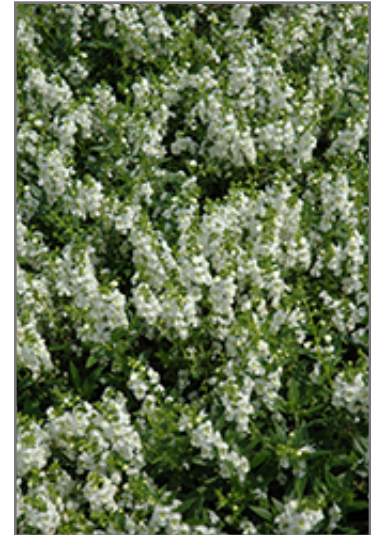
Serenita White Angelonia flowers