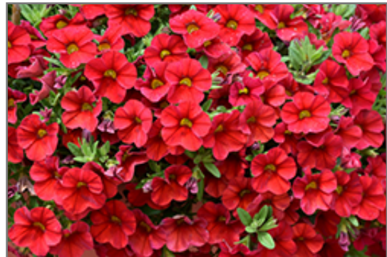
Superbells Red Calibrachoa flowers

Superbells Red Calibrachoa is recommended for the following landscape applications;