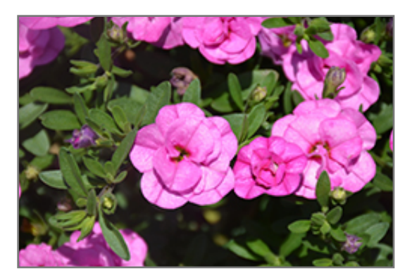
MiniFamous Double Pink Calibrachoa flowers

MiniFamous Double Pink Calibrachoa is recommended for the following landscape applications;