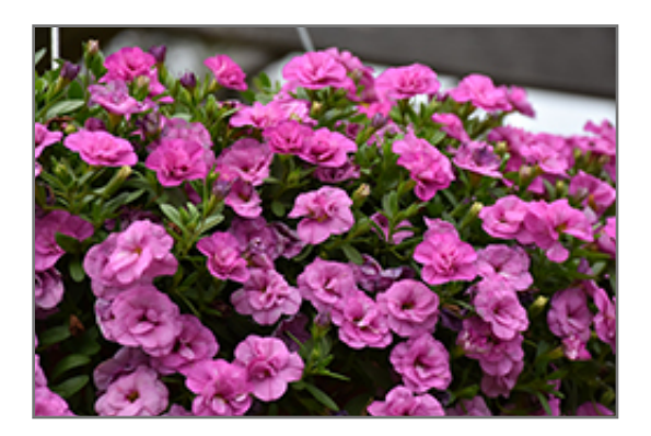
MiniFamous Double Pink Calibrachoa flowers