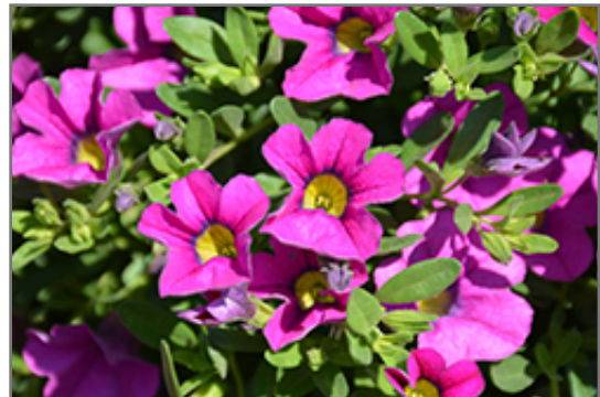
Million Bells Trailing Pink Calibrachoa flowers

Million Bells Trailing Pink Calibrachoa is recommended for the following landscape applications;