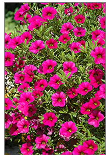
Cabaret Rose Calibrachoa flowers