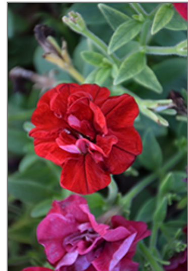
SweetSunshine Red Petunia flowers