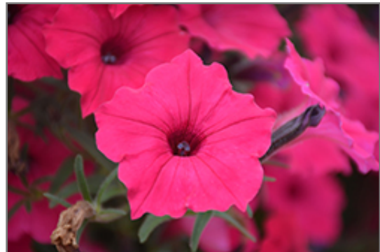
Supertunia Vista Fuchsia Petunia flowers