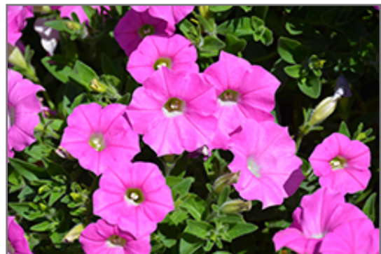
Shock Wave Pink Shades Petunia flowers