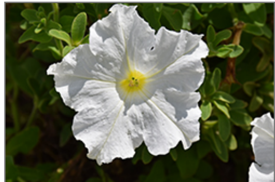
Pretty Flora White Petunia flowers