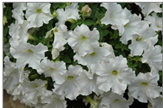
Pretty Flora White Petunia flowers