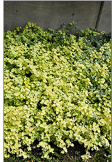
Lemon Licorice Plant