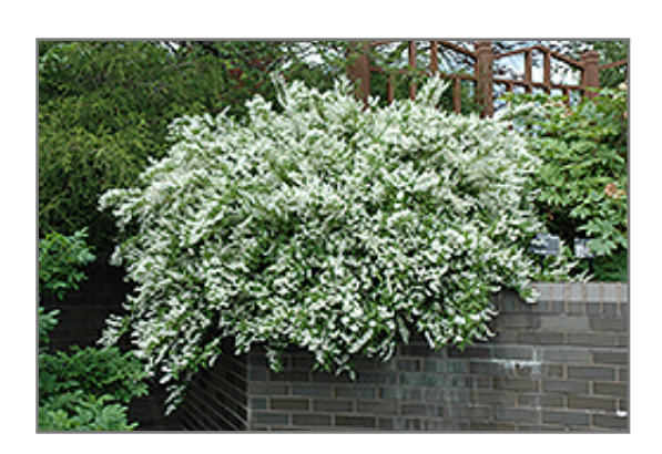
Slender Deutzia in bloom

Slender Deutzia will grow to be about 3 feet tall at maturity, with a spread of 4 feet. It has a low canopy. It grows at a slow rate, and under ideal conditions can be expected to live for approximately 20 years.