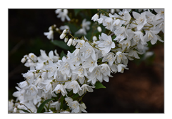
Slender Deutzia flowers

8546 Sun Valley Road Anytown, USA 12345 204.782.4147