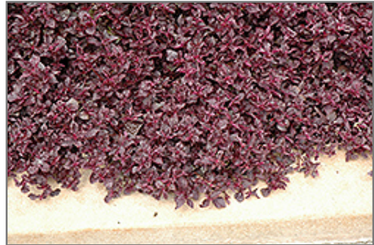
Purple Lady Blood Leaf