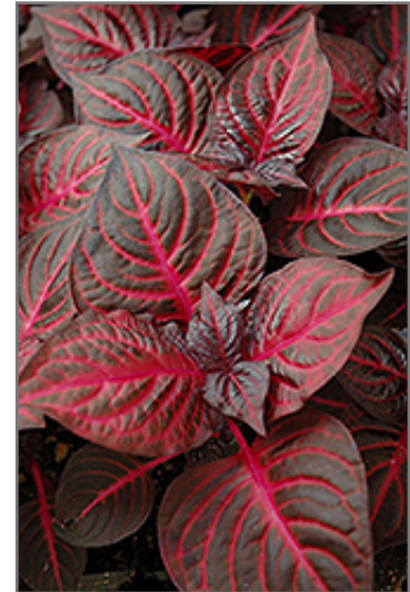
Blazin' Rose Blood Leaf foliage