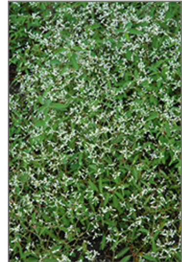
Breathless White Euphorbia flowers