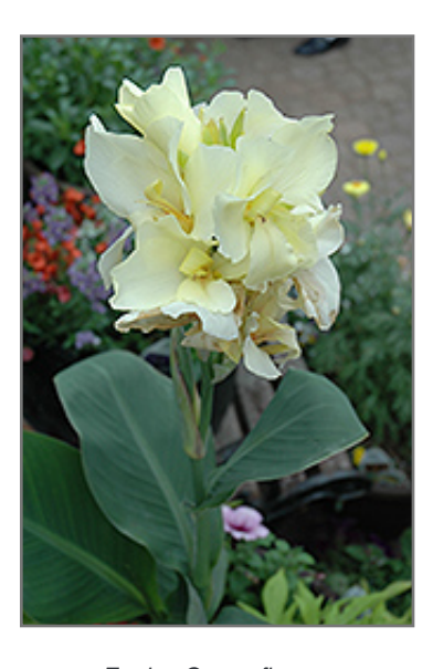
Ermine Canna flowers