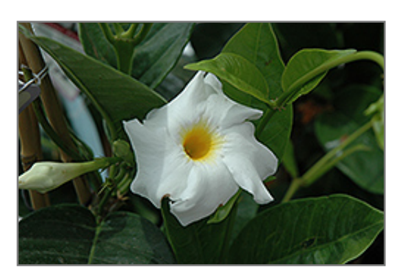
Bride's Cascade Mandevilla flowers

This tropical plant does best in full sun to partial shade. It requires an evenly moist well-drained soil for optimal growth. It may require supplemental watering during periods of drought or extended heat. It is not particular as to soil type or pH. It is highly tolerant of urban pollution and will even thrive in inner city environments. This particular variety is an interspecific hybrid, and parts of it are known to be toxic to humans and animals, so care should be exercised in planting it around children and pets. It can be propagated by cuttings; however, as a cultivated variety, be aware that it may be subject to certain restrictions or prohibitions on propagation.