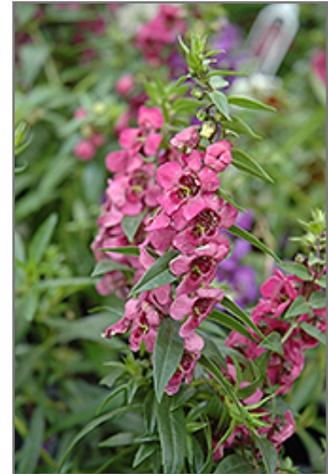
Pink Angelonia flowers