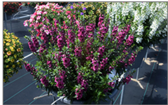
Archangel Raspberry Angelonia in bloom