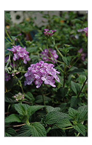
Lavender Swirl Lantana flowers

Lavender Swirl Lantana will grow to be about 12 inches tall at maturity, with a spread of 4 feet. It has a low canopy. It grows at a fast rate, and under ideal conditions can be expected to live for approximately 20 years.