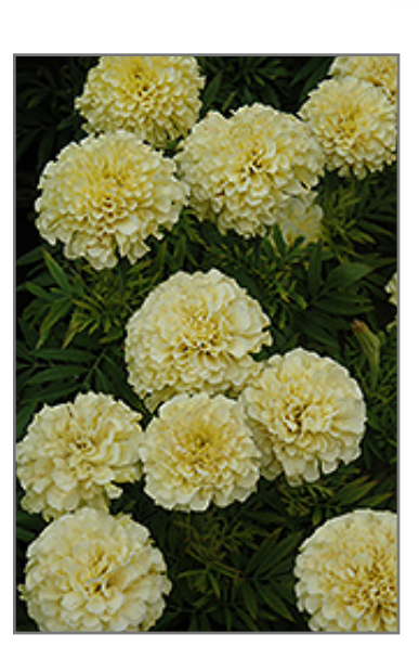
French Vanilla Marigold flowers

French Vanilla Marigold will grow to be about 24 inches tall at maturity, with a spread of 10 inches. When grown in masses or used as a bedding plant, individual plants should be spaced approximately 8 inches apart. Its foliage tends to remain dense right to the ground, not requiring facer plants in front. This fast-growing annual will normally live for one full growing season, needing replacement the following year.