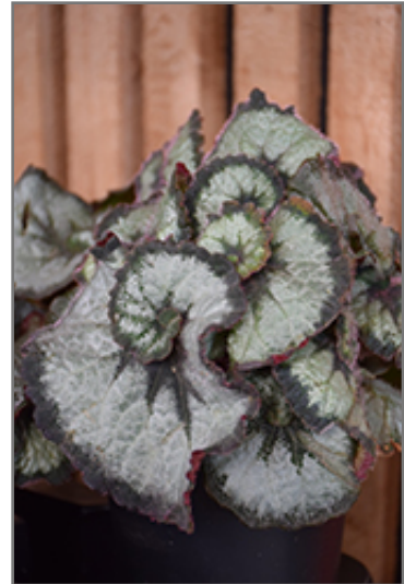
Escargot Begonia foliage