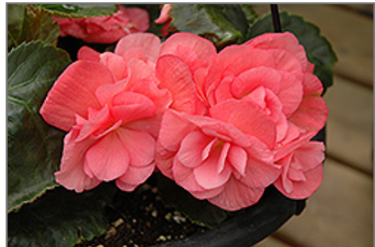
Dragone Pink Hope Begonia flowers

Dragone Pink Hope Begonia is recommended for the following landscape applications;