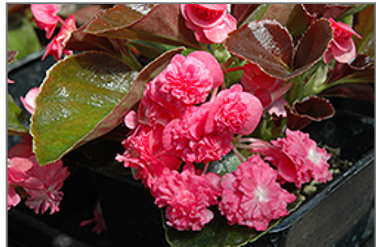
Doublet Rose Begonia flowers