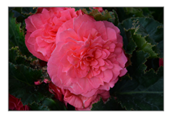
Nonstop Pink Begonia flowers

Nonstop Pink Begonia is recommended for the following landscape applications;