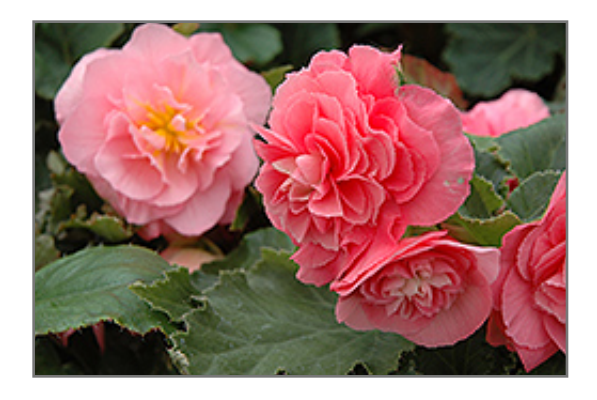
Nonstop Pink Begonia flowers