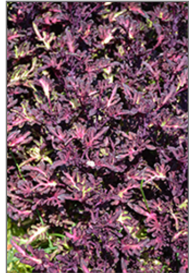
Merlin's Magic Coleus foliage