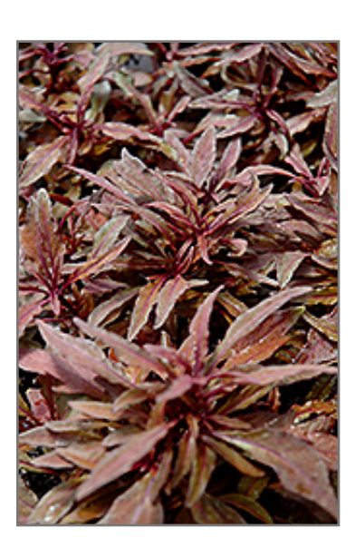
ColorBlaze Velvet Mocha Coleus foliage

ColorBlaze Velvet Mocha Coleus will grow to be about 3 feet tall at maturity, with a spread of 24 inches. When grown in masses or used as a bedding plant, individual plants should be spaced approximately 20 inches apart. Although it's not a true annual, this fast-growing plant can be expected to behave as an annual in our climate if left outdoors over the winter, usually needing replacement the following year. As such, gardeners should take into consideration that it will perform differently than it would in its native habitat.