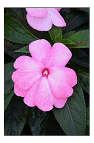
Super Sonic Pastel Pink New Guinea Impatiens flowers