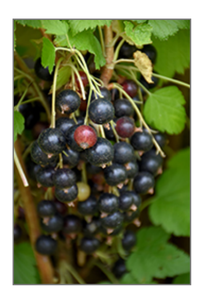
Ben Sarek Black Currant fruit

Aside from its primary use as an edible, Ben Sarek Black Currant is sutiable for the following landscape applications;