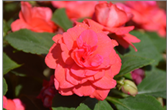
Rockapulco Coral Reef Impatiens flowers