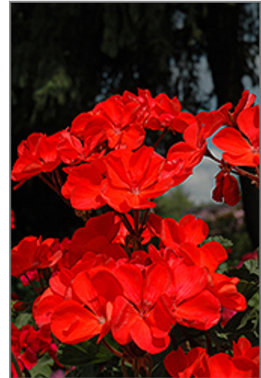
Fantasia Coral Geranium flowers