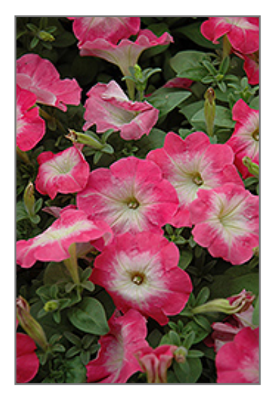
Primetime Salmon Morn Petunia flowers

Primetime Salmon Morn Petunia is a dense herbaceous annual with a mounded form. Its medium texture blends into the garden, but can always be balanced by a couple of finer or coarser plants for an effective composition.