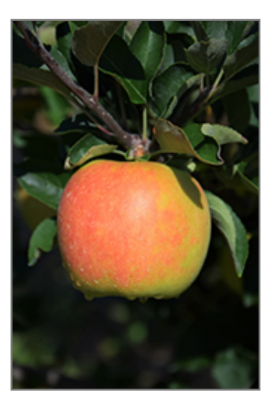
Ambrosia Apple fruit

Ambrosia Apple features showy clusters of lightly-scented white flowers with shell pink overtones along the branches in mid spring, which emerge from distinctive rose flower buds. It has forest green deciduous foliage. The pointy leaves turn yellow in fall. The fruits are showy red apples with a light green blush, which are carried in abundance in late summer. The fruit can be messy if allowed to drop on the lawn or walkways, and may require occasional clean-up.