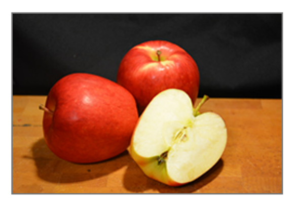
Ambrosia Apple fruit and flesh