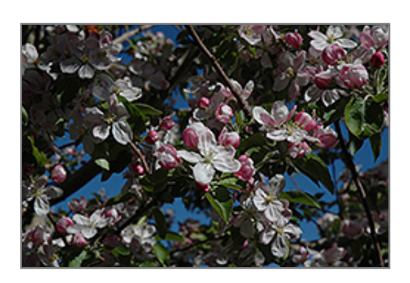
Ambrosia Apple flowers

This tree is typically grown in a designated area of the yard because of its mature size and spread. It should only be grown in full sunlight. It prefers to grow in average to moist conditions, and shouldn't be allowed to dry out. It may require supplemental watering during periods of drought or extended heat. It is not particular as to soil type or pH. It is highly tolerant of urban pollution and will even thrive in inner city environments. This particular variety is an interspecific hybrid.