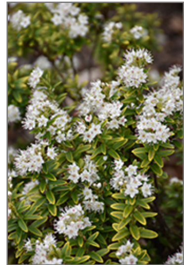
Sand Myrtle flowers

Sand Myrtle makes a fine choice for the outdoor landscape, but it is also well-suited for use in outdoor pots and containers. Because of its height, it is often used as a 'thriller' in the 'spiller-thriller-filler' container combination; plant it near the center of the pot, surrounded by smaller plants and those that spill over the edges. It is even sizeable enough that it can be grown alone in a suitable container. Note that when grown in a container, it may not perform exactly as indicated on the tag - this is to be expected. Also note that when growing plants in outdoor containers and baskets, they may require more frequent waterings than they would in the yard or garden.