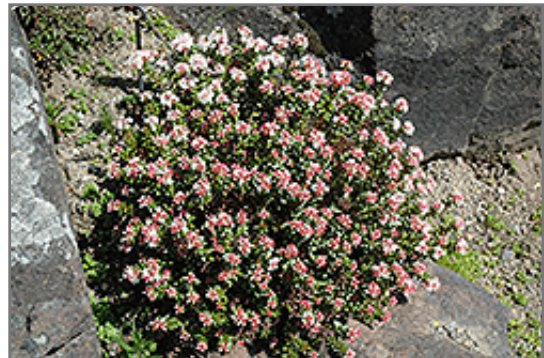
Sand Myrtle in bloom

Sand Myrtle is recommended for the following landscape applications;