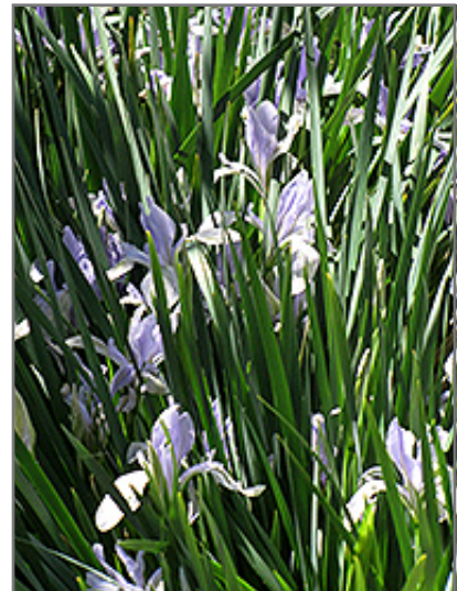
Pallas Chinese Iris in bloom