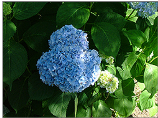
Big 'n' Blue Hydrangea flowers

Big 'n' Blue Hydrangea will grow to be about 6 feet tall at maturity, with a spread of 6 feet. It tends to be a little leggy, with a typical clearance of 1 foot from the ground, and is suitable for planting under power lines. It grows at a fast rate, and under ideal conditions can be expected to live for approximately 20 years.