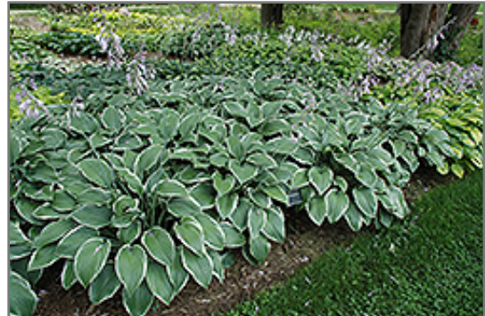
Winter Snow Hosta in bloom